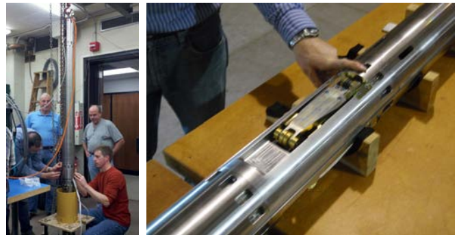
a) Testing of the Replicate Coring system in the lab, b) close-up of the Replicate Coring actuator section